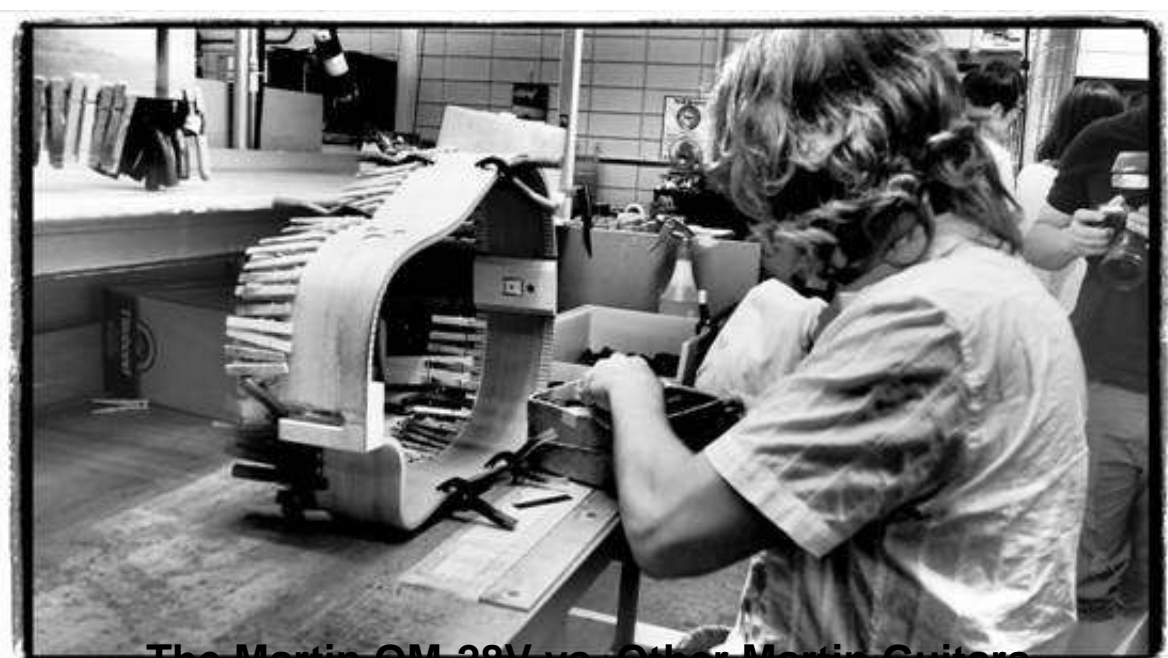
The Martin OM 28V vs. Other Martin Guitars

Overall, the Martin OM-28V is a high-quality guitar with a rich history and unique features that make it a popular choice among guitar enthusiasts and professionals alike.